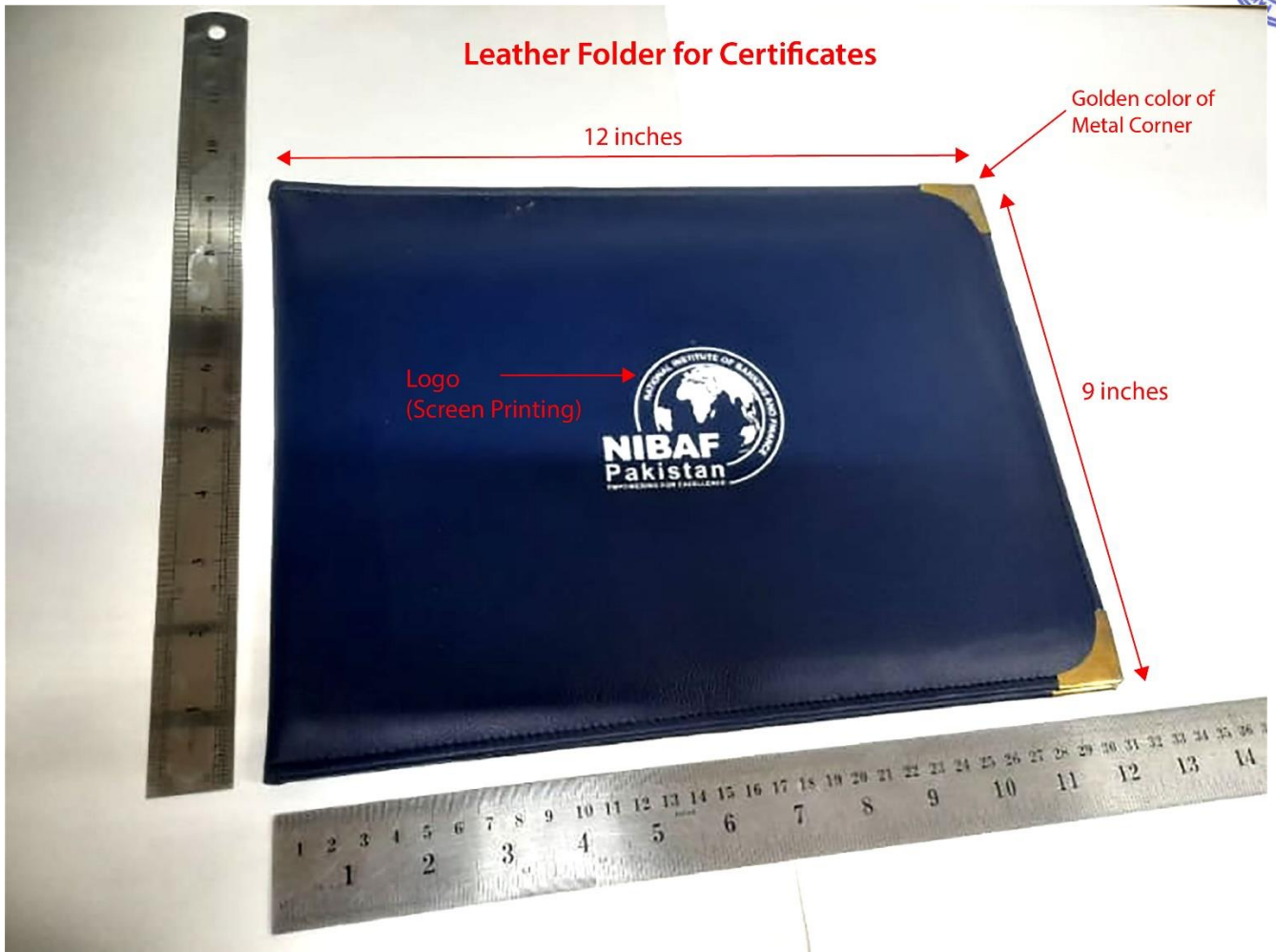
Figure 1 : Leather Folder Closed